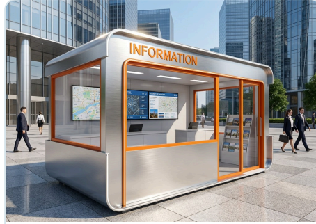
Information and ticketing booth Public facility or transport reference.