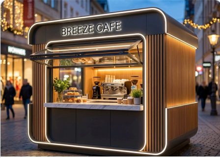
Coffee and beverage kiosk Retail and food service reference.

Outdoor kiosk projects are quoted by size, facade, function, service window, counter, signage, electrical configuration and export packing method.