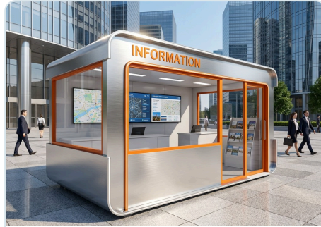
Information and ticketing booth Public facility or transport reference.