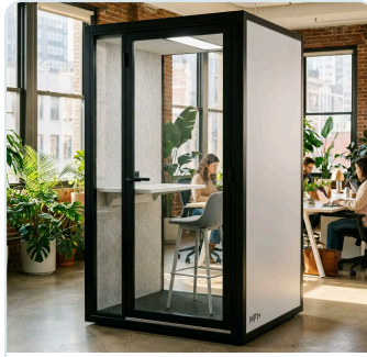
MP1+ Phone Booth Wider single-person booth.