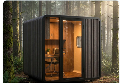
Garden office or service room Custom outdoor modular reference.