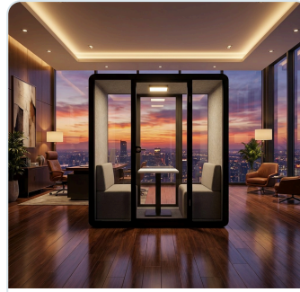
MP2 Meeting Booth Two-person meetings and interviews.