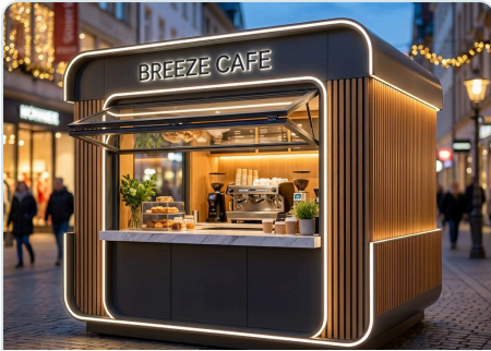
Coffee and beverage kiosk Retail and food service reference.

Outdoor kiosk projects are quoted by size, facade, function, service window, counter, signage, electrical configuration and export packing method.