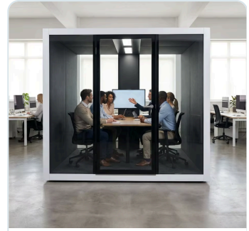
MP3 Meeting Booth Four-person discussions and small rooms.