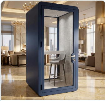
MP1 Office Pod Single-person calls and focus work.

MobileX office pods combine aluminum alloy frame, galvanized steel panel and tempered glass. Standard models can be customized by color, socket, voltage and logo. Acoustic description: up to 35dB noise reduction depending on installation environment.